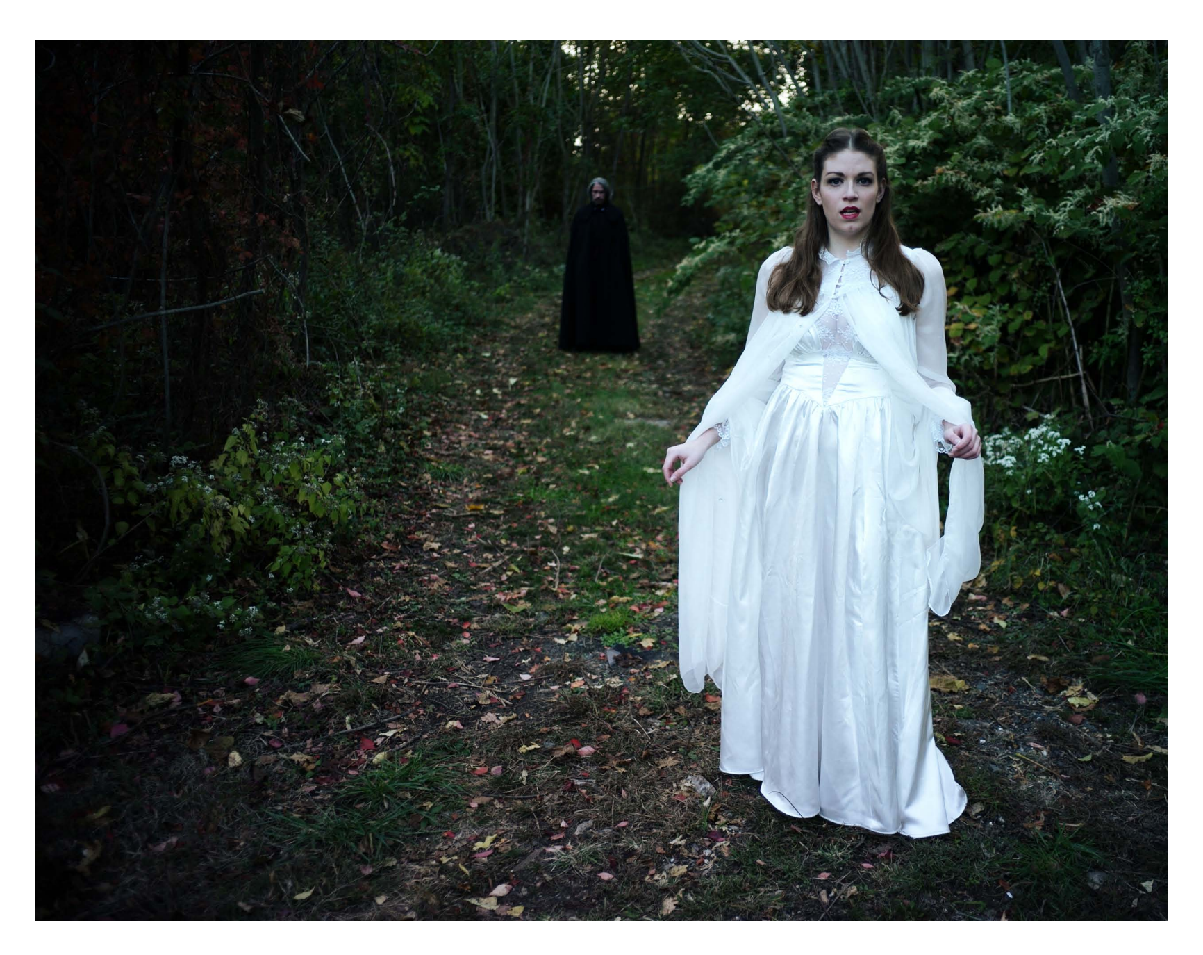
"I awoke; but I did not fear to go to sleep again although the boughs or bats or something flapped almost angrily against the window-panes."