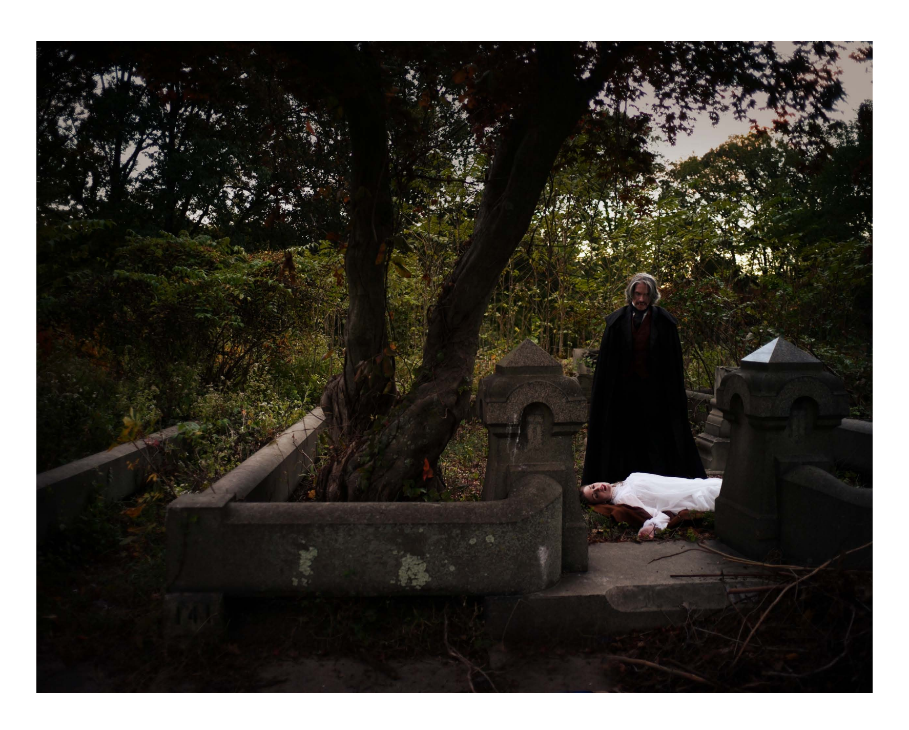
"Just over the external jugular vein there were two punctures not large but not wholesome looking. There was no sign of disease but the edges were white and worn-looking as if by some trituration. It at once occurred to me that this wound or whatever it was might be the means of that manifest loss of blood; but I abandoned the idea as soon as formed for such a thing could not be."