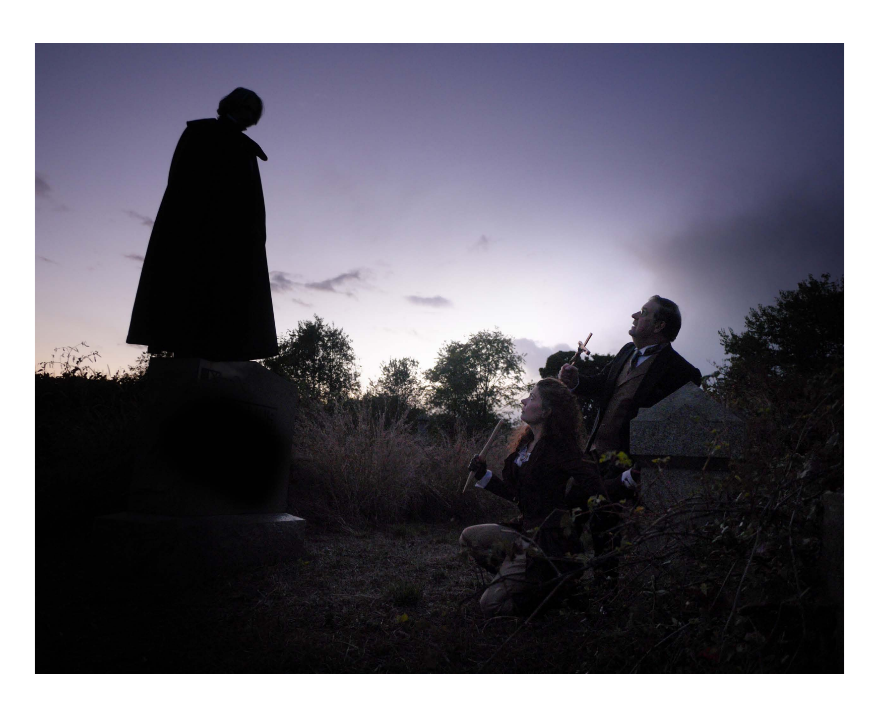
"The Count suddenly stopped just as poor Lucy had done outside the tomb — as we lifting our crucifixes advanced:"