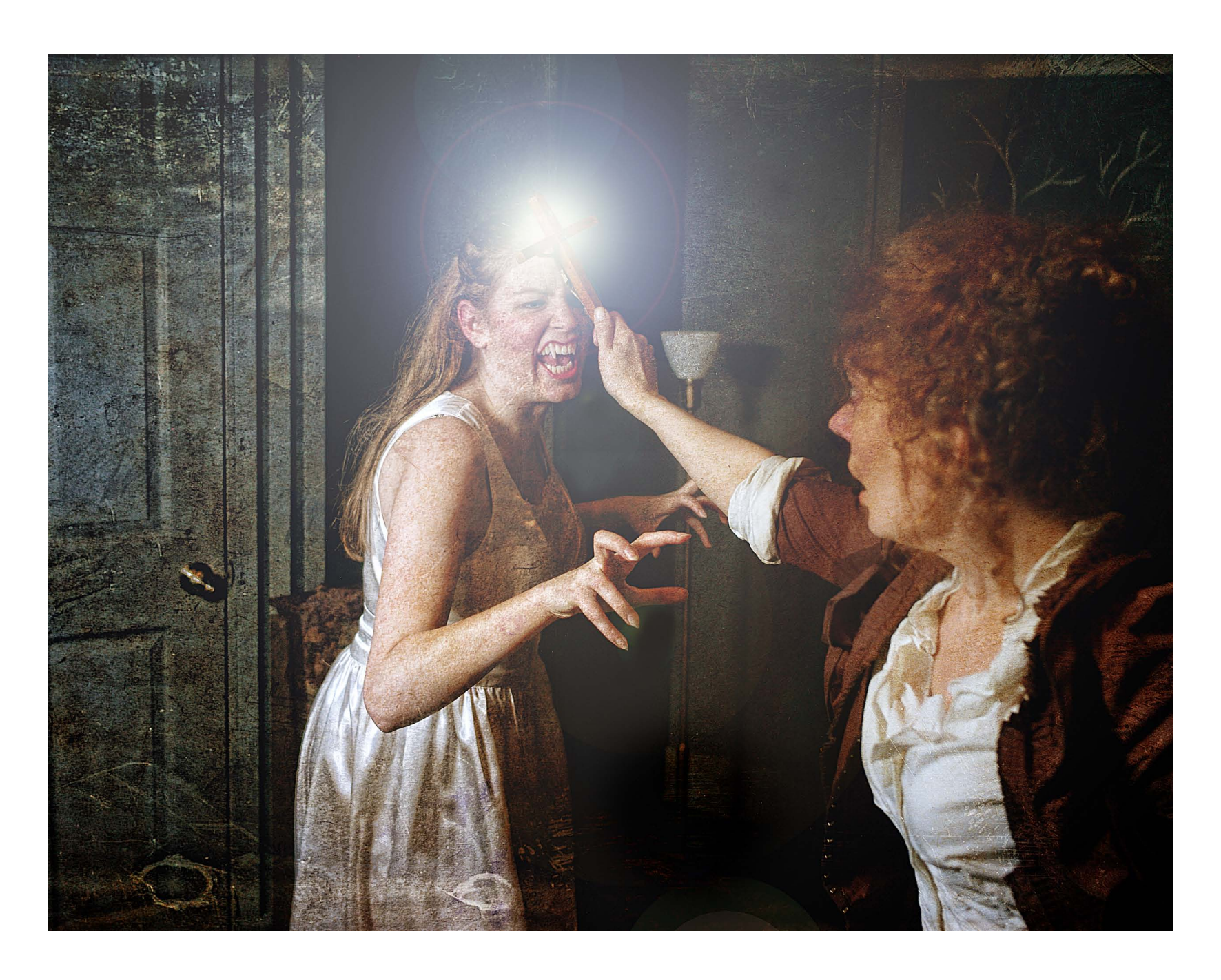
"There was a fearful scream which almost froze our hearts to hear ... it had ... burned into the flesh as though it had been a piece of white-hot metal·"