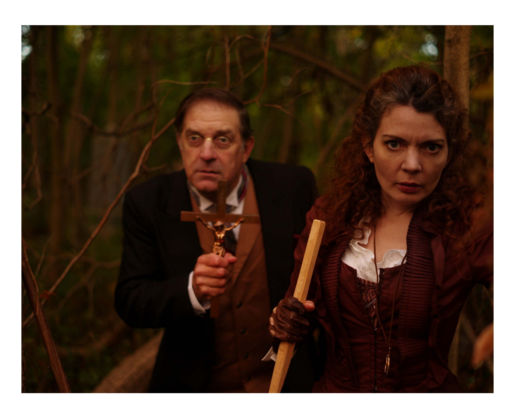
"Brave lad! A moment's courage and it is done. This stake must be driven through her It will be a fearful ordeal:"