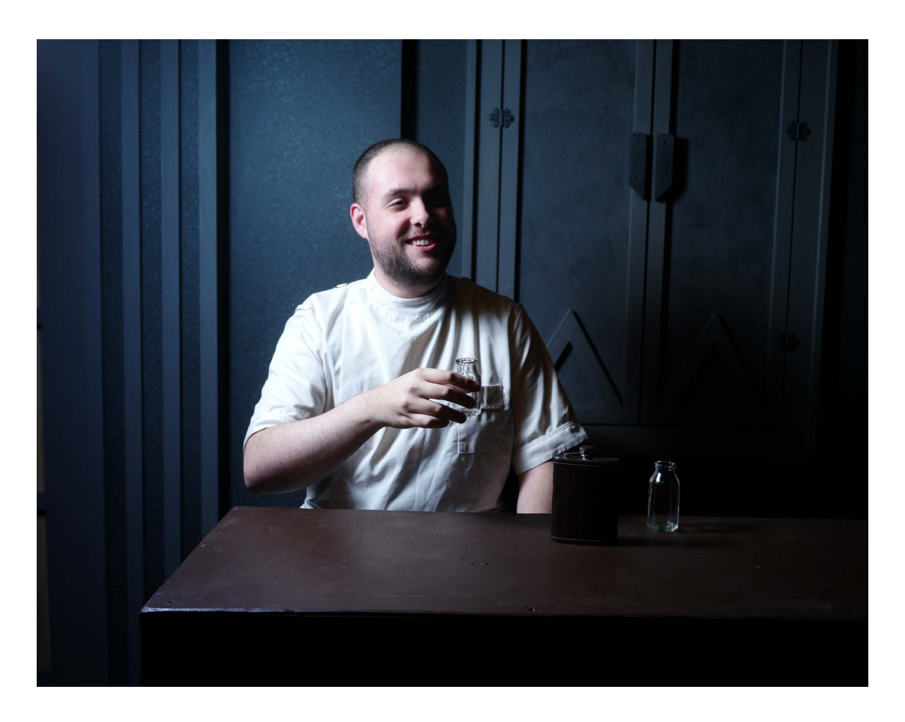
"The attendant has just been to me to say that Renfield has been very sick and has disgorged a whole lot of feathers. 'My belief is doctor 'he said 'that he has eaten his birds and that he just took and ate them raw!'"