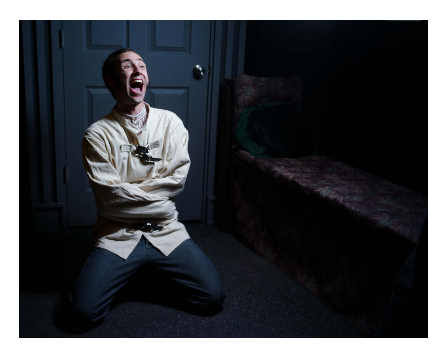
"I don't want any souls indeed indeed! I don't I couldn't use them if I had them; they would be no manner of use to me I couldn't eat them \cdots "